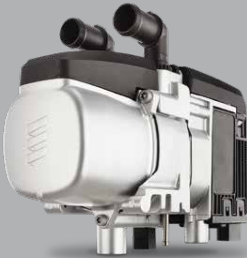
Product picture does not show series scope